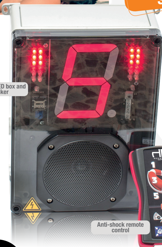
Anti-shock remote control