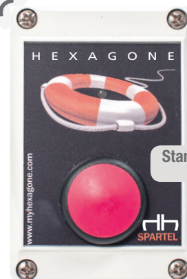
Standard wall panic button